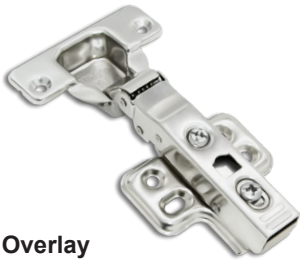
F4 Full Overlay