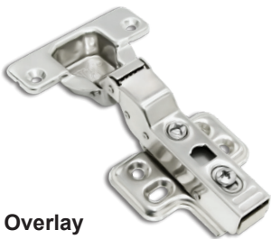
H4 Half Overlay