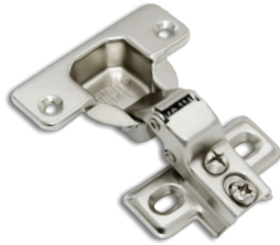
F2 Full Overlay